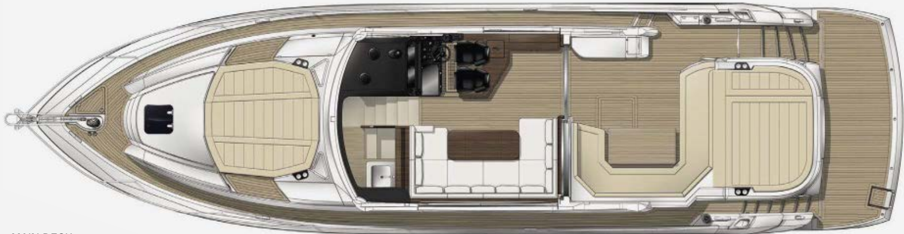
MAIN DECK Shown with optional teak side decking