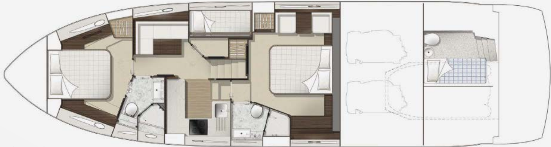
LOWER DECK Shown with optional crew cabin