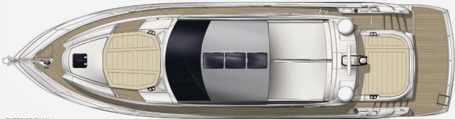
EXTERIOR PLAN Shown with optional teak side decking