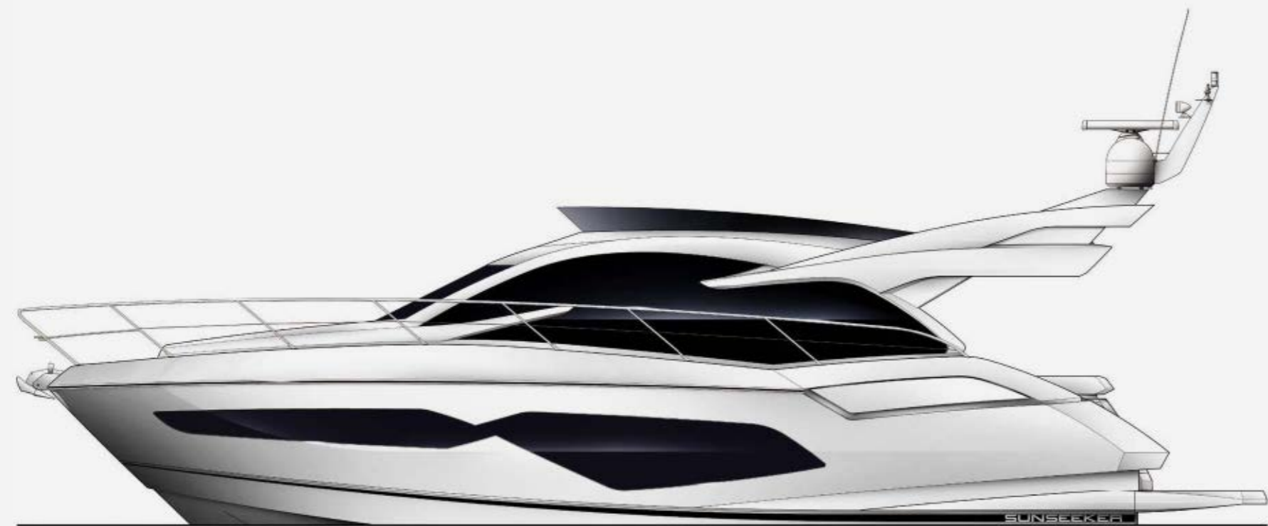
SIDE PROFILE Optional hardtop available