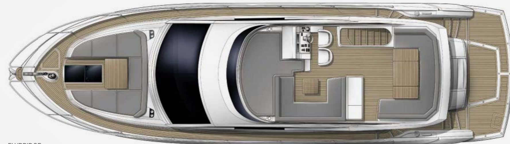
FLYBRIDGE Shown with optional teak side and flybridge decking