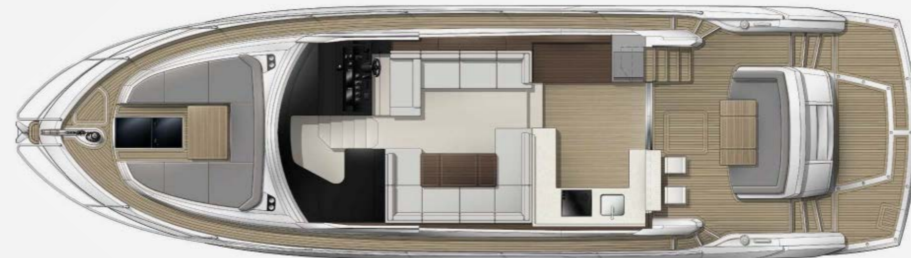
MAIN DECK Shown with optional lifting platform, teak side decking and foredeck / aft cockpit tables