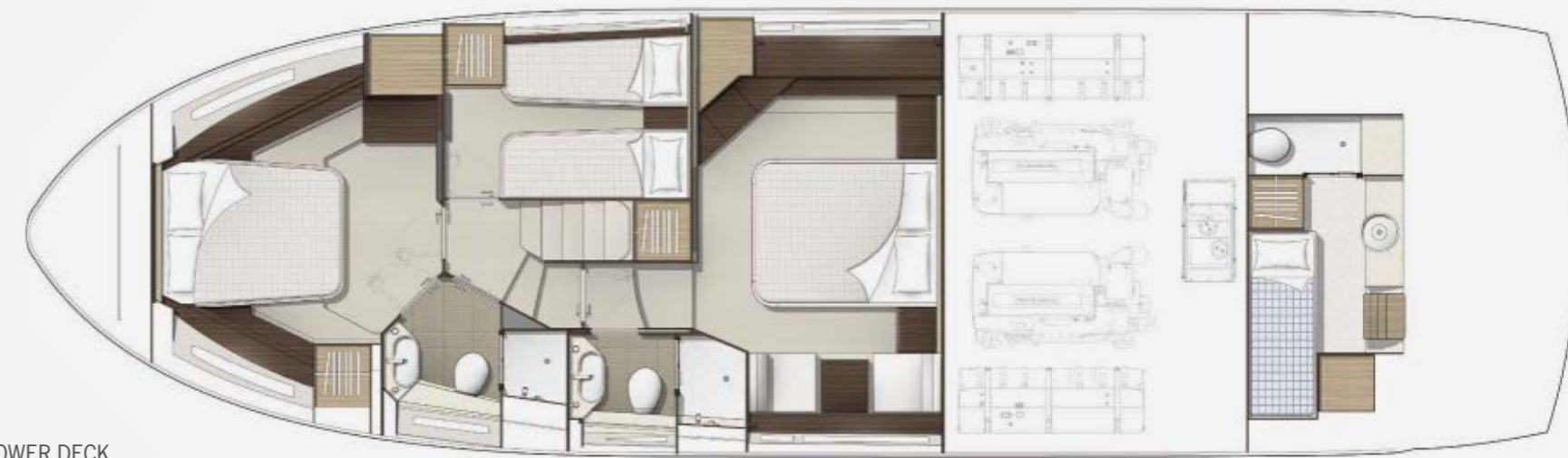
LOWER DECK Shown with optional crew cabin